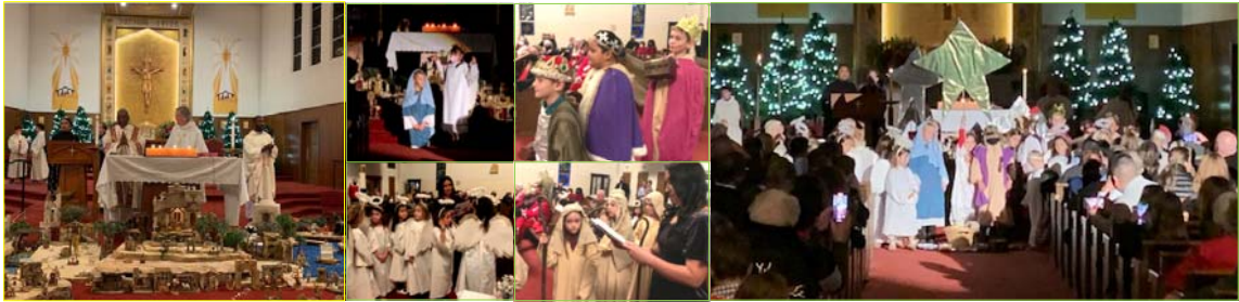
Christmas Pageant performed by St. Isabella School

The magi search for something bigger than themselves. They seek eternal wisdoms. They are prepared to give time out of their lives in this quest for the hunger of their souls. Once finding it, they no longer search for idolatrous gods.