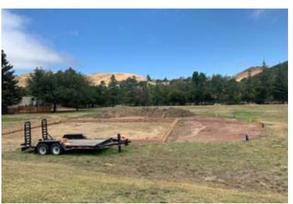
Parish field—school is adding a playground